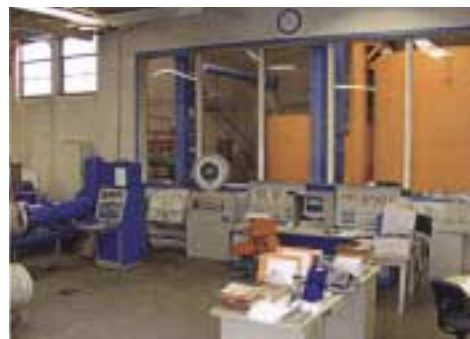
NIST certified calibration lab

Our NIST certified calibration laboratory provides water calibration on flowmeters up to 30" in diameter. ABB can help you keep your flowmeter measurements accurate and is equipped to calibrate almost any flow technology and brand name available.