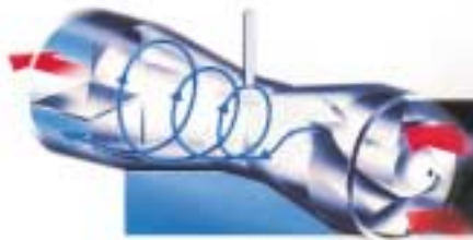
Stream flow in a swirl flowmeter

The TRIO-WIRL Series of high performance swirl and vortex flowmeters use innovative digital signal processing (DSP) to produce measurements with impressively high reliability. All meters in the Series use two-wire technology for low cost, simple installation. The measurement converters have analog outputs, freely configurable switching outputs and are available in intrinsically safe, explosion or dual certified versions.