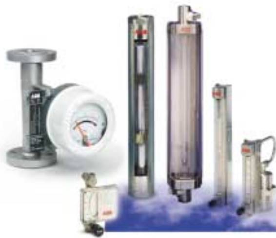
Variable area flowmeter

When ABB acquired the Fischer & Porter Company a new era in variable area history began. Building on the strength of 65 years of variable area innovations and one of the largest installed customer bases, ABB has the best variable area flowmeters in the market today.