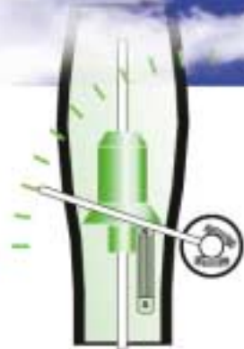
Functional diagram of the metal tube variable area flowmeter

Proven and inexpensive - ABB variable area flowmeters. For the measurement of gases, liquids and steam at low flow rates, a large range of models ensure that there is a suitable device for every application.