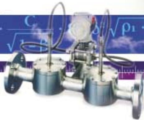
Wedge Meter II